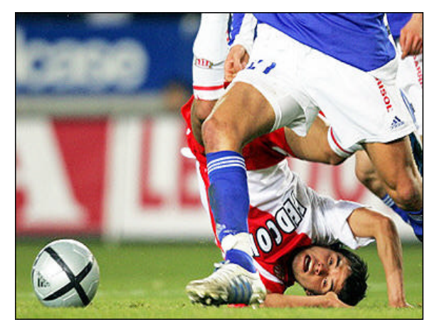
Maybe all you need is a different viewpoint!

The POST TIMES has examined some values and issues that families may face after redeployment. The values of legacy, determination, resilience, stability, healthy lifestyle, ideals, and passion are only a few that could have been addressed. The intent of these newsletters has been to prompt thought, reflection, and discussion. And to help military families improve communication. If they have been helpful, please pass them on to someone you know that may need some home improvement.